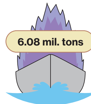
Uranium ※ 2 (Jan. 2021)

(Note) Reserves-to-production (R/P) ratio = Proven Reserves / Annual Production