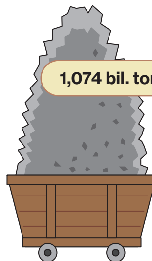
Coal ※ 1 (at the end of 2020)