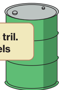
Oil ※ 1 (at the end of 2020)